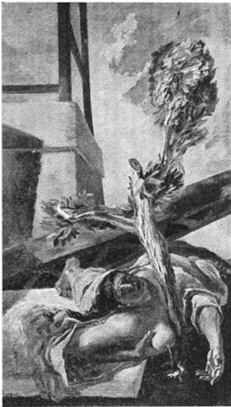
STUDY , in oil, commissioned by Museum of Modern Art, 1932, for three-part mural by Franklin Watkins; central panel of "Spirit of Man, Nourishing the Tree of Life."

text. Finally he starts painting—while the man with a bucket of whitewash waits behind him, poised to spring forth into action.