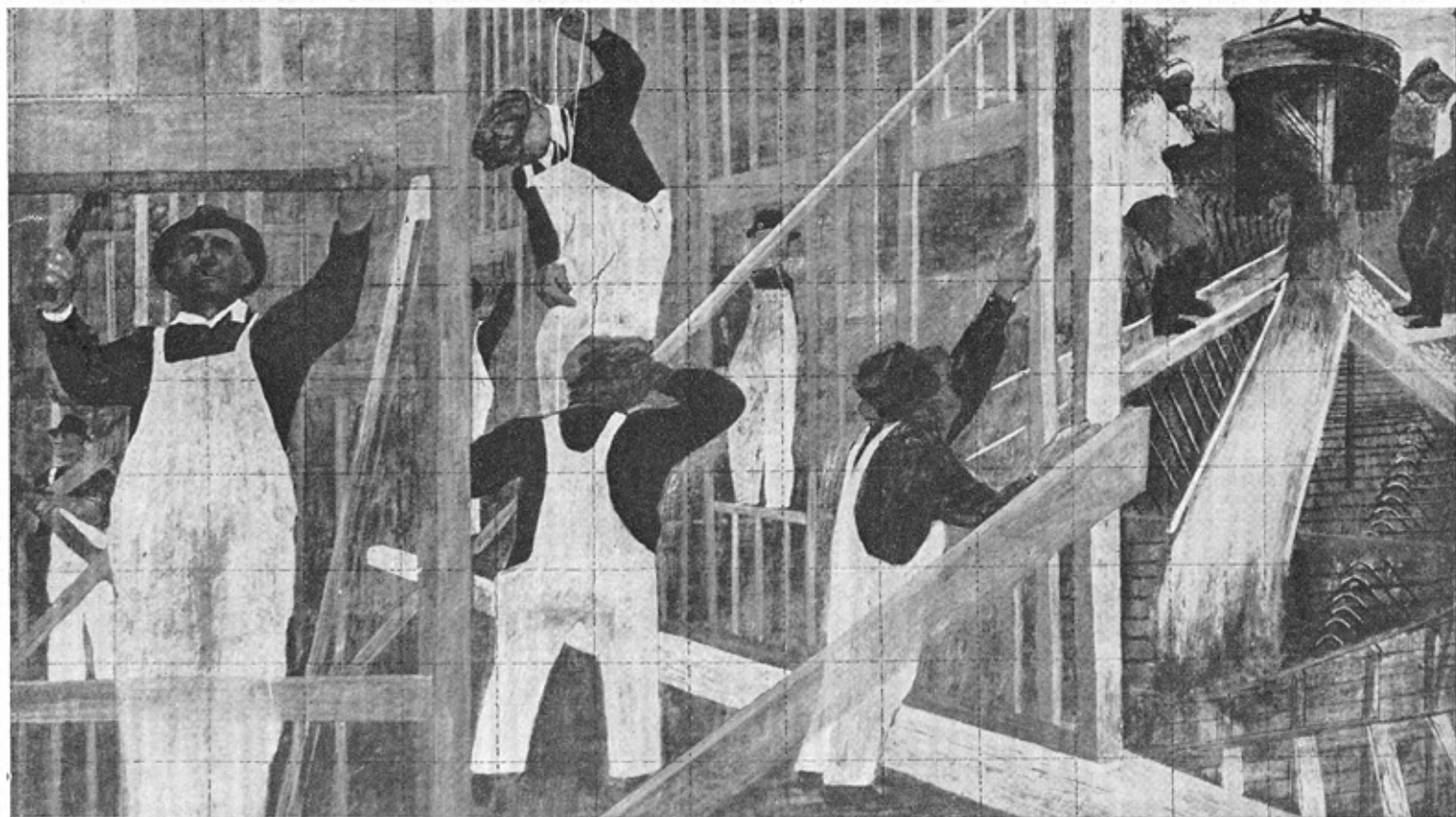
FRESCO TECHNIQUE requires systematic successive manipulations—tracing, squaring, pouncing, mason and painter elbowing each

But the painting on the wall needs also to be the funnel through which much besides art is relayed to the onlooker. For its intended public, any man liable to enter a church, a ministry, a postoffice, art can be only the side dish—to be savoured imperceptibly as it were, while a major theme, patriotic, social or religious, is digested. The muralist must cater to this very real need of laymen for a familiar aperture to bring into focus the revelation of esthetics. Styles that do not allow of story telling lack certain mural requirements. The muralist must in-